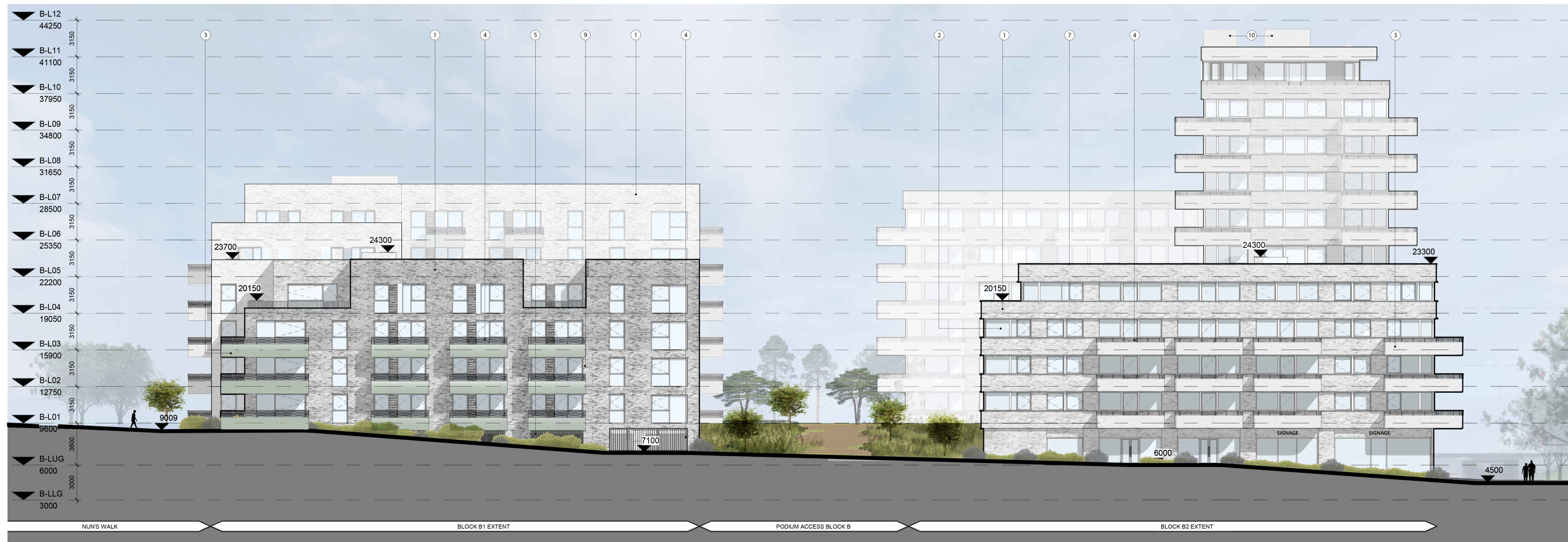
Block B - West Elevation