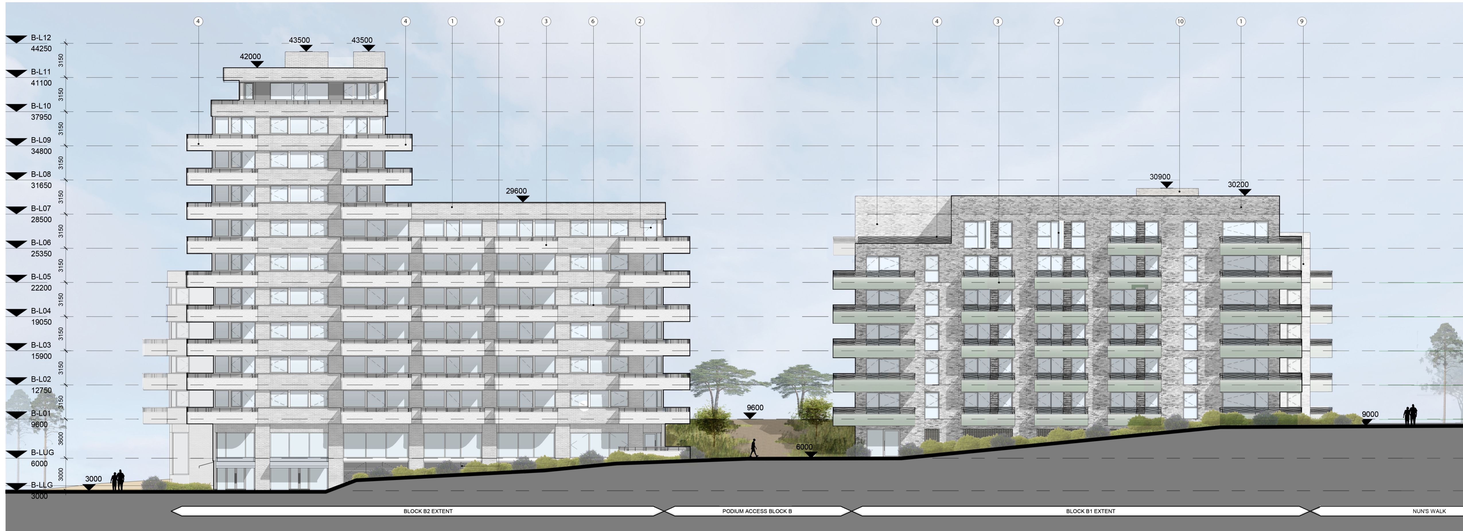
Block B - East Elevation